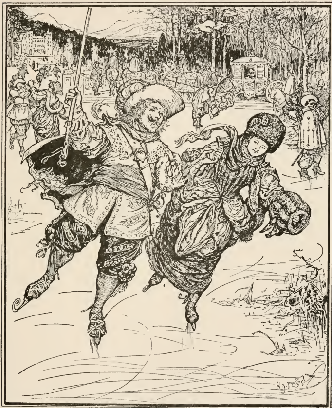
The Queen envies the Flemish skaters.

and watch them and judge of their skill. It was certainly very surprising, and the fact that Spanish ladies could at that time skate at all was still more so. They all